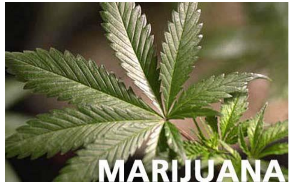
Colorado Steps Up Education and Enforcement of Drugged Driving BY JOIN TOGETHER STAFF May 22nd, 2014

Visit the ACAP Website at www.sapacap.com